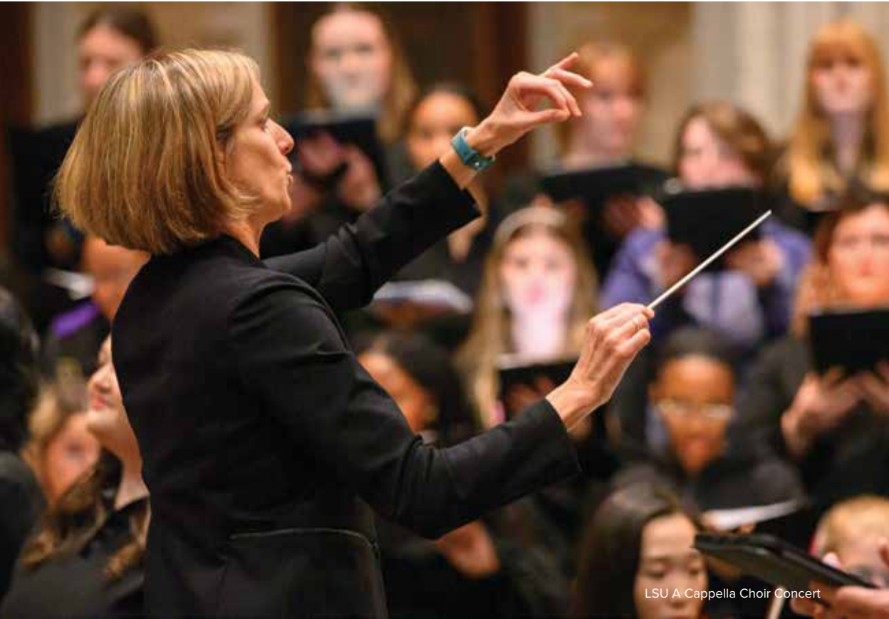
LSU A Cappella Choir Concert

The LSU Choral Studies area offers a variety of choral ensembles for students, each with an individual character and mission. Chorus members represent a cross-section of the LSU student population, including undergraduate and graduate students, who perform literature ranging from dramatic cantatas to gospel spirituals and folksongs.