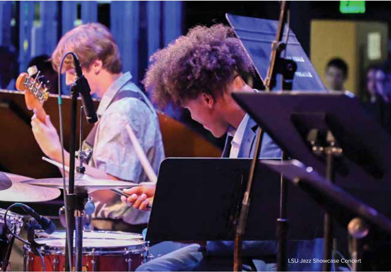
LSU Jazz Showcase Concert