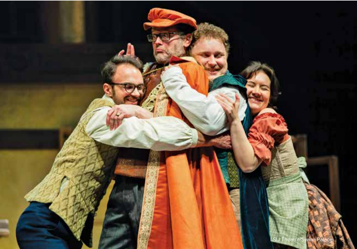
LSU Theatre/Swine Palace

Offering comprehensive training from the undergraduate to graduate level, the School of Theatre is home to a community of artists, educators, and scholars, dedicated to the creation, cultivation, and understanding of the dramatic narrative arts. From passionate actors, dancers, and filmmakers to innovative designers, directors and technicians we feature the work of our students through a diverse array of productions annually, ranging from classic to contemporary work.