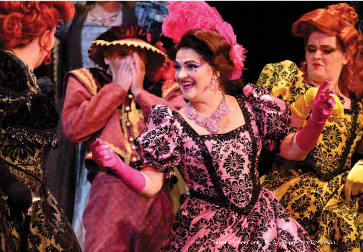
Turner-Fischer Center for Opera presents Cendrillon

The Turner-Fischer Center for Opera at LSU offers a comprehensive training program for aspiring opera students, who work with dynamic and accomplished faculty. The Center produces multiple full-scale productions each year, collaborating with the LSU Orchestral Studies area and LSU School of Theatre. Alumni can be seen performing on the world's greatest opera stages, including the Metropolitan Opera, La Scala, Covent Garden, Houston Grand Opera, San Francisco Opera, and more.